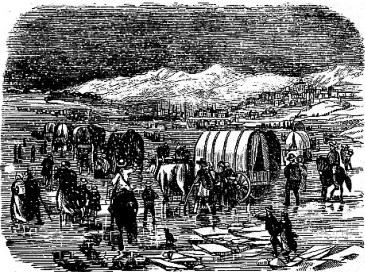
MORMONS LEAVING NAUVOO ON THEIR JOURNEY WESTWARD.