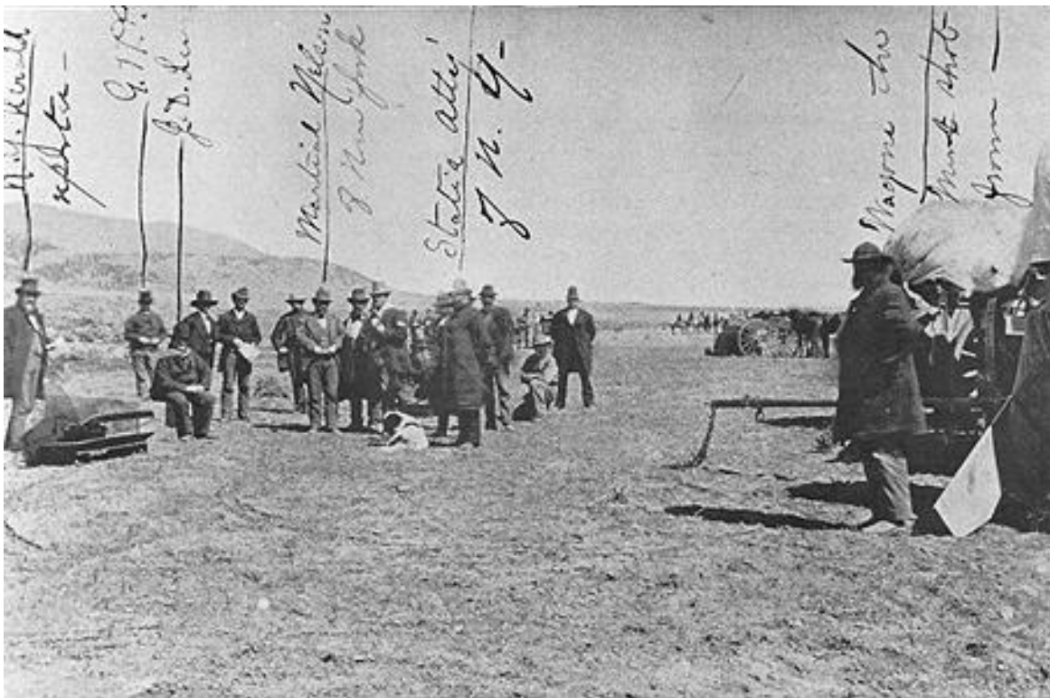
A PHOTOGRAPH OF LEE JUST BEFORE THE EXECUTION. (Not published in the book.)