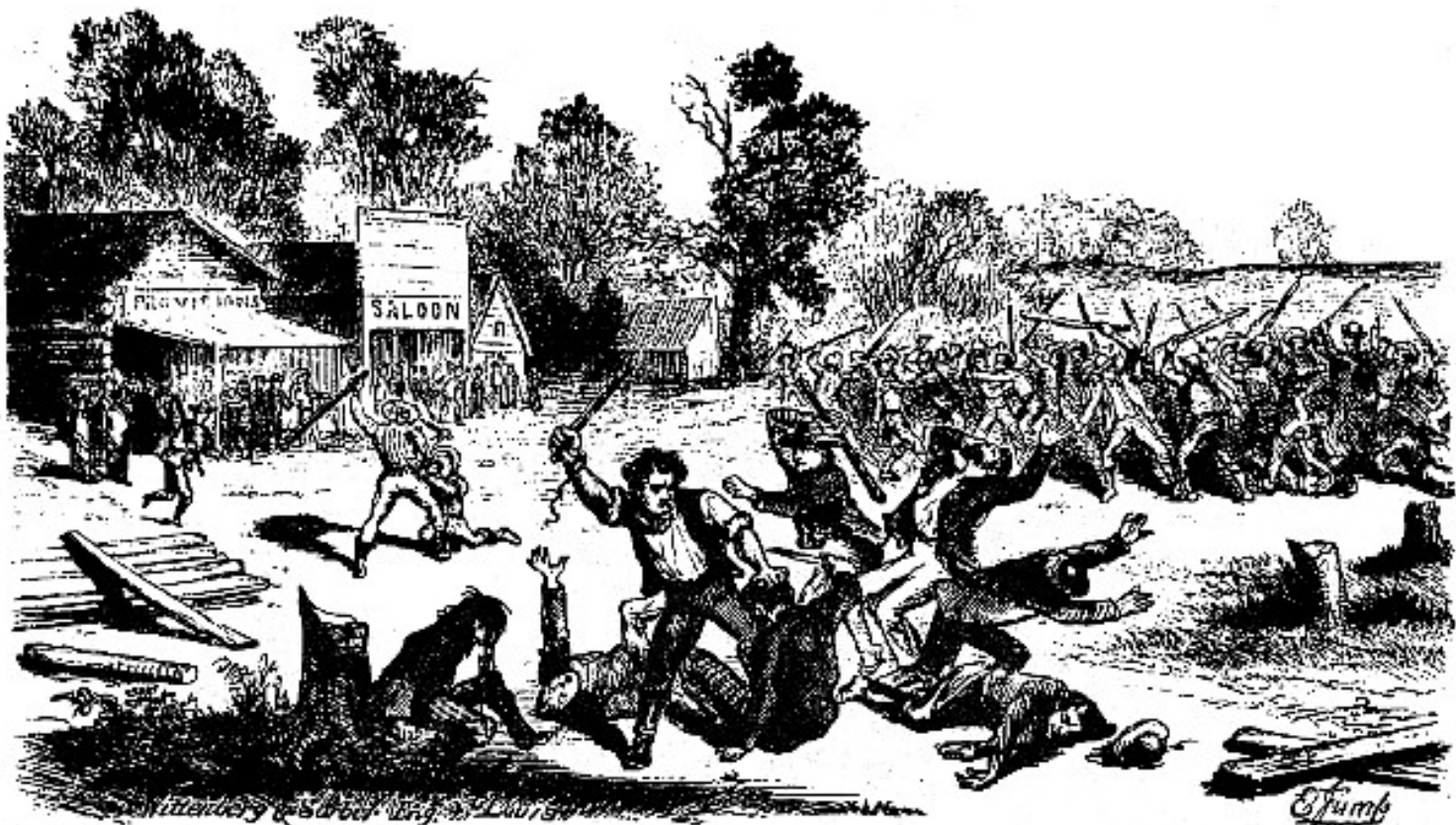
FIGHT AT GALLATIN, MISSOURI, BETWEEN MORMONS AND "GENTILES."