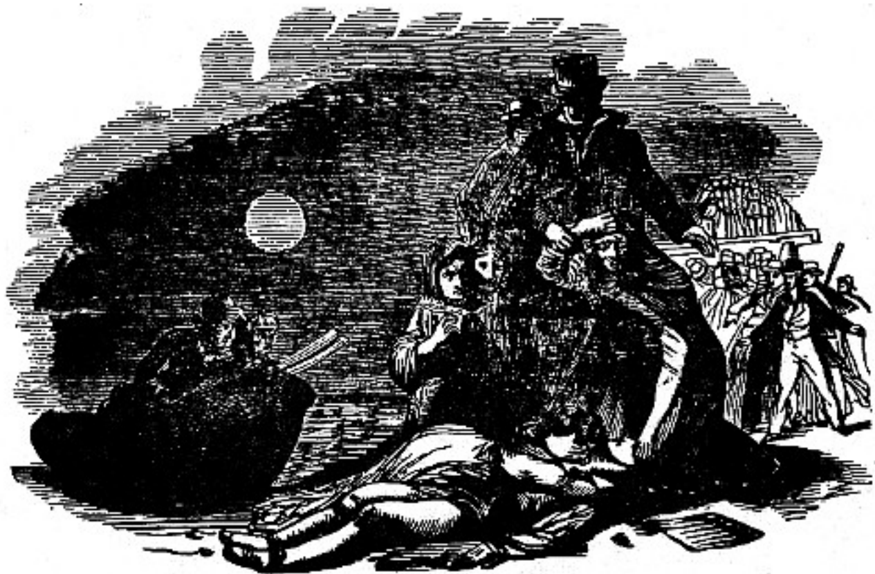
A "BLOOD ATONED" VICTIM, NEAR NAÛVOO.

I was in Brigham Young's office about this time. His brother Joseph, and quite a number of others were present, when Brigham raised his band and said, "I swear by the eternal Heavens that I have unsheathed my sword, and I will never return it until the blood of the Prophet Joseph and Hyrum, and those who were slain in Missouri, is avenged. This whole nation is guilty of shedding their blood, by assenting to the deed, and holding its peace. "Now," said he, "betray me, any of you who dare to do so!" Furthermore, every one who had passed through their endowments, in the Temple, were placed under the most sacred obligation to avenge the blood of the Prophet, whenever an opportunity offered, and to teach their children to do the same, thus making the entire Mormon people sworn and avowed enemies of the American nation.