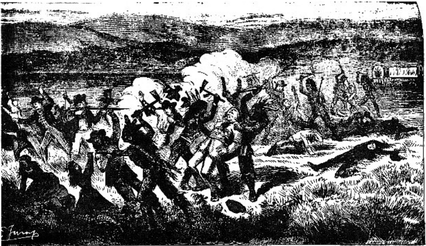
THE MOUNTAIN MEADOWS MASSACRE.