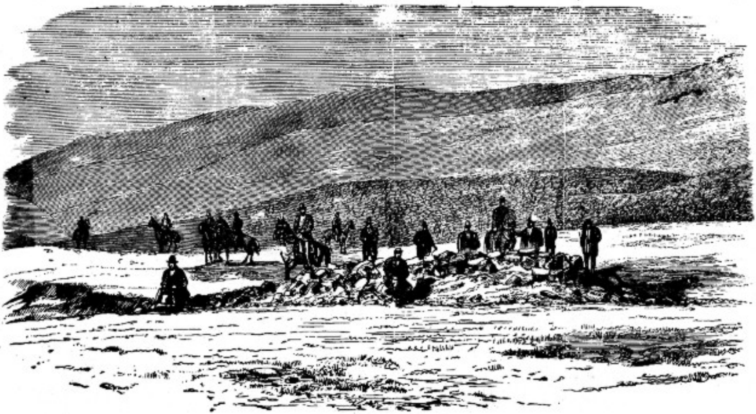
PRESENT APPEARANCE OF MOUNTAIN MEADOWS. (From a photograph taken just before Lee's execution.)

At the time of the massacre, if the evidence of the vampires who acted as Church slaves to secure the conviction of Lee are to be believed, the Meadows were covered with an abundance of rank, nutritious grasses, and was a beautiful, smiling spot of earth, inviting the beholder to rest and repose.