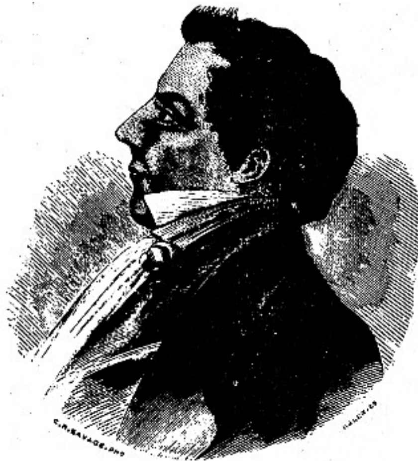
JOSEPH SMITH. (The Founder and first Prophet of the Mormon Church.)